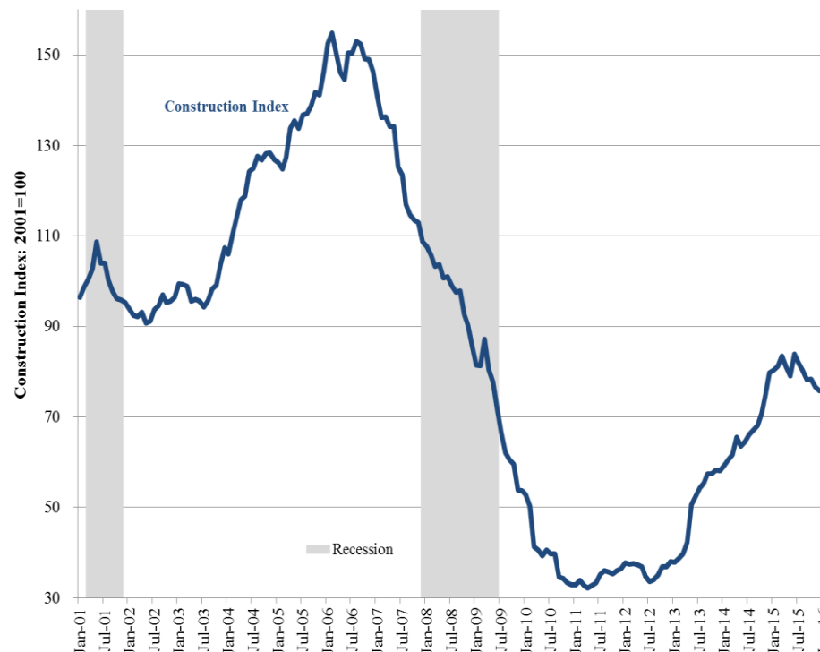
Reno MSA Construction Index

The Index shows a 1.93% increase between February and March 2016, the latest period for which all series data are available. The index decreased by 8.05% from the same period last year (March 2015 and 2016). After months of decreases in the index in 2015, the index increased slightly in January and fell in February, before increasing again in March 2016.